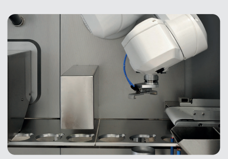
Robots as an alternative Robotic arms can also take over the handling of the products for assembly.