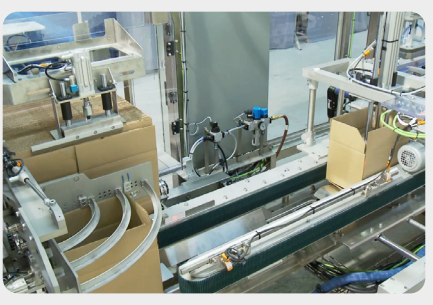
Cleanest In Its Class Proven "Pin & Dome" technology allows for clean, abrasion-free case erecting – no vacuum needed.