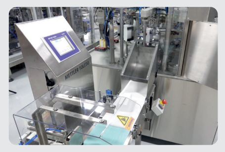
QC & Check Weighing Ability to add quality control features such as weighing technologies or cameras.

Specially-sized buckets with suction cup mechanism hold cartons in place, gently guiding them throughout the cartoning process – perfect for keeping thin-walled and fragile paperboard cartons clean.